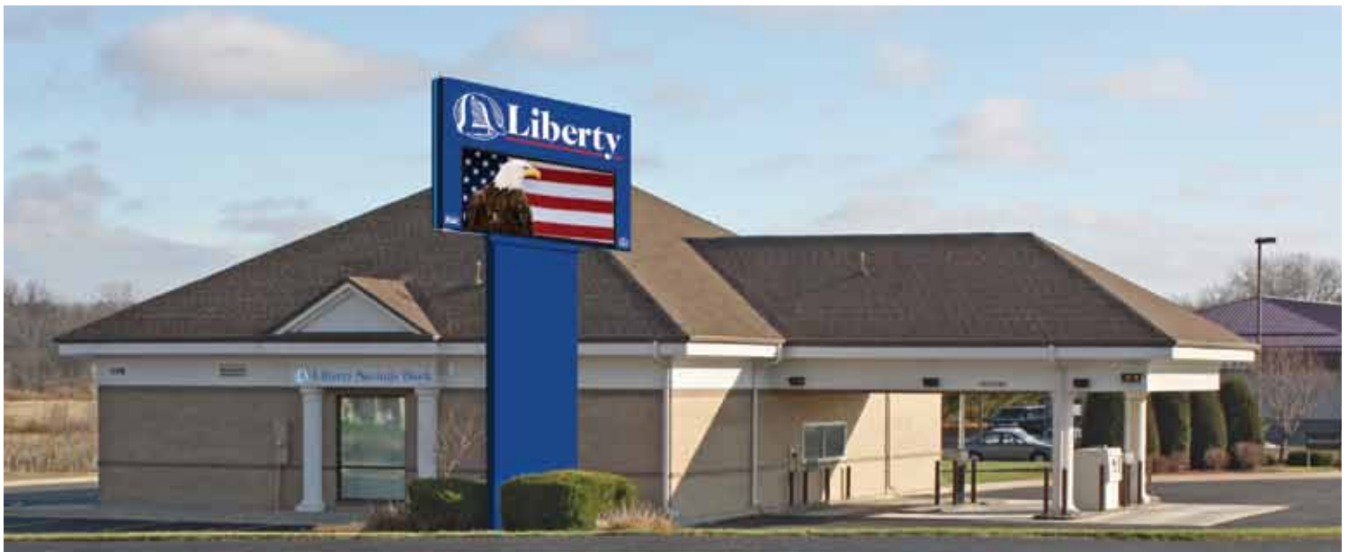
The new Sartell branch of Liberty Savings Bank is located at 198 Pine Cone Road, Sartell, MN 56377

On December 3rd, 2012 Liberty opened its newest branch in Sartell. Liberty purchased this site and many of the assets from Integrity Bank Plus. This is a prime location in the community with great convenience for many people who already have a relationship with Liberty.