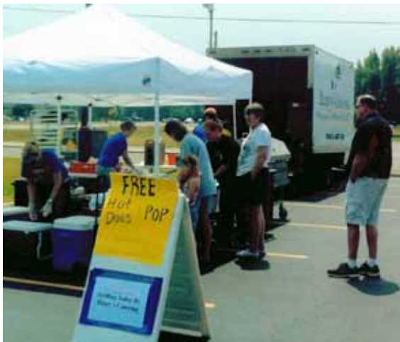
There were plenty of Liberty customers ready to eat!

Free Hot Dogs and fixins were given out at each of our branches during August. Every Friday one of the Liberty branches provided hot dogs served by Henry's Catering and beverages to go with it. Judging by the comments and catsup stains Customers enjoy these kinds of "end of week" treats and we enjoy serving them up!