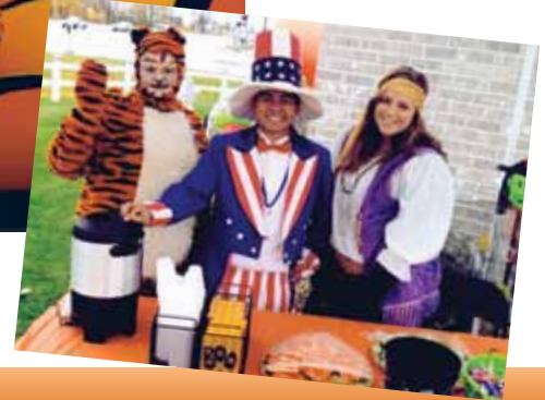
Can you recognize the Liberty employees? We can't either! They really got into the Halloween spirit this year.